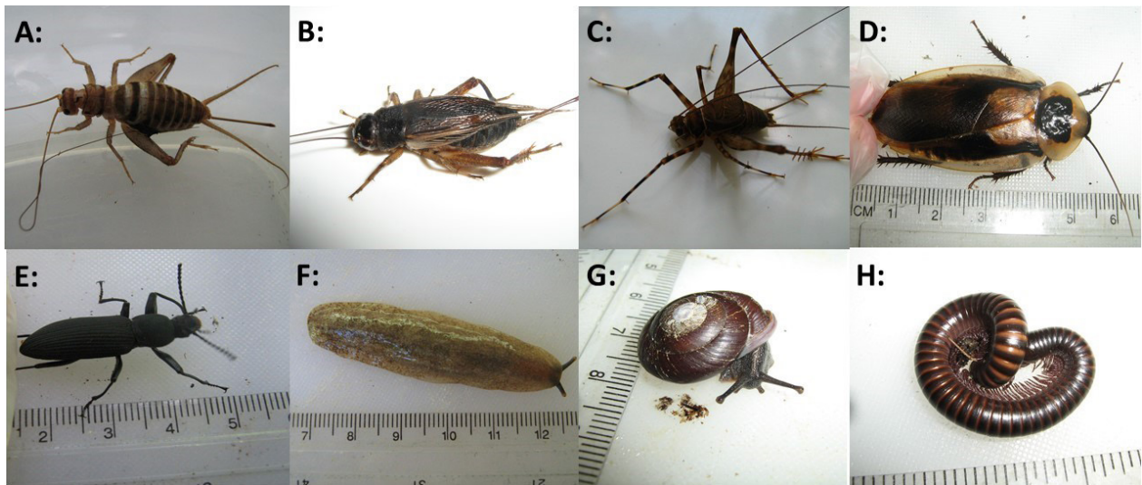
Fig. 2. Cultured species at the CBP in Dominica. (A) Gryllodes sigillatus . (B) Gryllus assimilis . (C) Caribacusta dominica . (D) Blaberus discoidalis . (E) Zophobas atratus . (F) Veronicella sloanii . (G) Pleurodonte dentiens . (H) Leptogoniulus sp.

These were removed from housing units after two weeks, or sooner if hatchlings were observed (Fig. 3B). After removal, oviposition sites were placed into separate housing units until all 1 st instar crickets hatched and exited the nest box. The substrate in the oviposition sites was kept moist at all times.